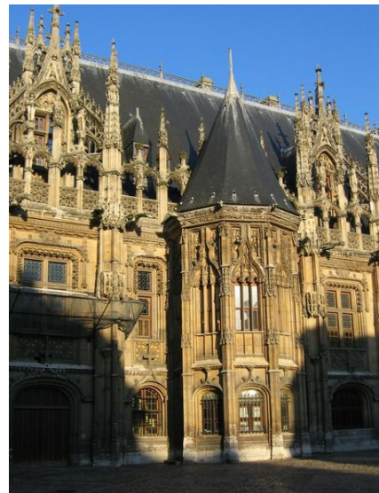
Rouen (ancien Parlement)