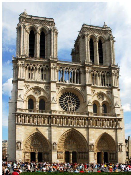
N.-D. de Paris