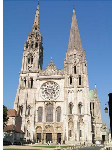
N.-D. de Chartres